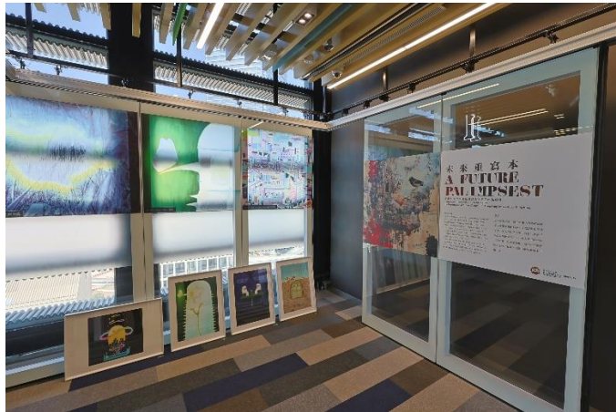
Photo 2: Following the ceremony, guests are invited to explore a captivating showcase of works created by graduates from the Department of Art and Design.