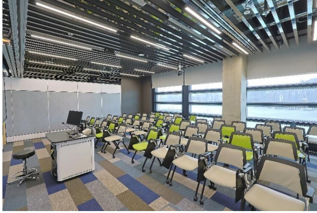
Photo 3 & 4: Located on the 15th floor of the M+ Tower, The Create spans around 840 square metres and adopts a modern minimalist design to enhance spatial quality and visual impact.

香港恒生大學 THE HANG SENG UNIVERSITY OF HONG KONG