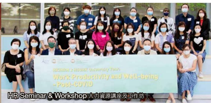
HR Seminar & Workshop 人力資源講座及工作坊