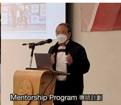
Mentorship Program 導師計劃