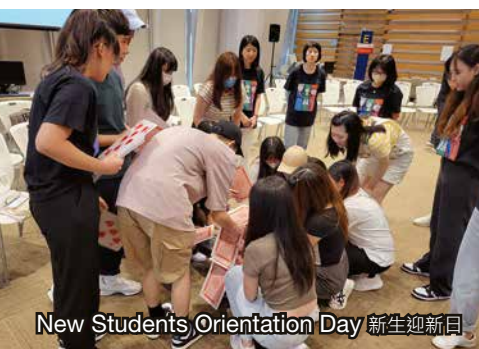
New Students Orientation Day 新生迎新日