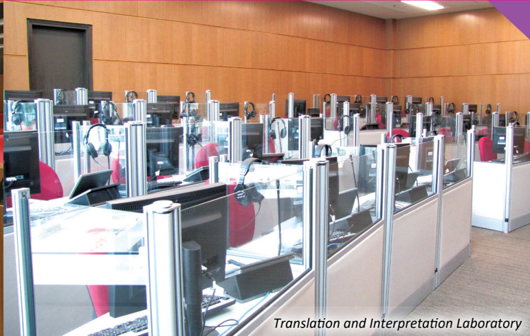
Translation and Interpretation Laboratory