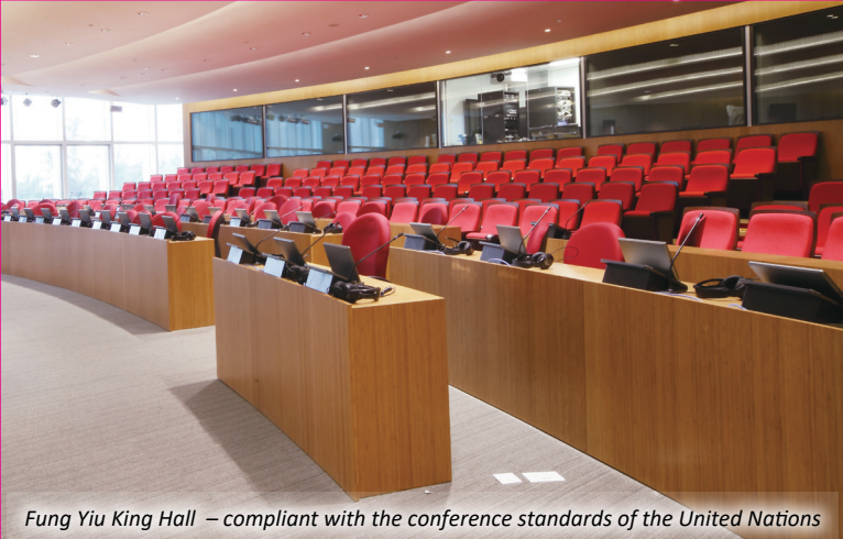
Fung Yiu King Hall – compliant with the conference standards of the United Nations